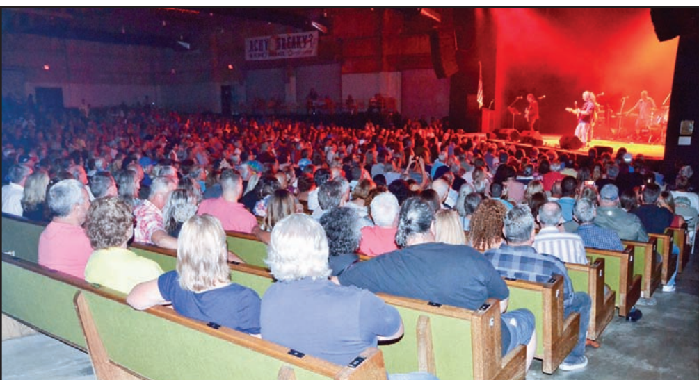
Musical acts Orleans and the Atlanta Rhythm Section were jamming all night long to the delight of a packed Anderson Music Hall June 5.