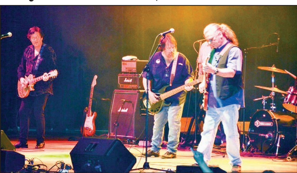
Atlanta Rhythm Section played from their classic stable of hits Saturday night, including "So Into You," "Spooky," "Champaign Jam" and more.