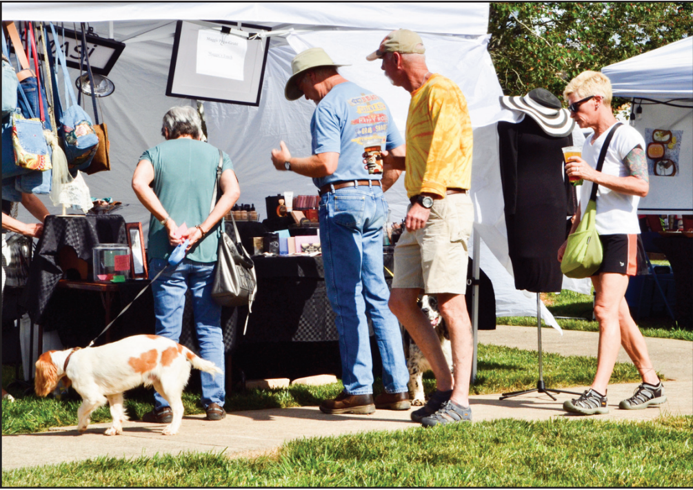
Be sure to check out the Hiwassee Night Market on the first Friday of every month between now and October.

"I have been (making scented candles) for many years. North Georgia and North Carolina have Scottish connections, so I wanted to bring some of the fragrances from Scotland and intertwine them with some of the fragrances around here."