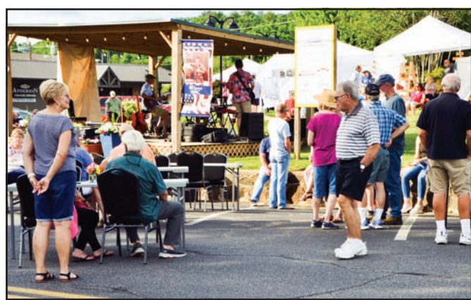
The First Friday market was, yet again, an incredible success for the City of Hiawassee, now in its second year.